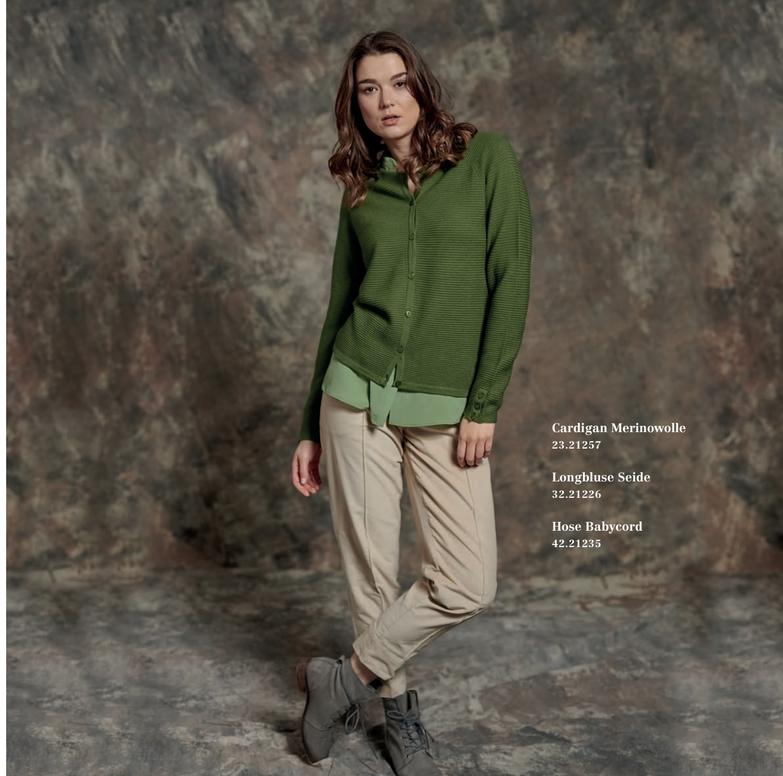
Cardigan Merinowolle 23.21257