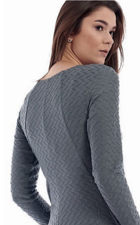
Kleid Viskosejersey 39.00564