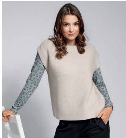
Pullunder Merinowolle 23.21254