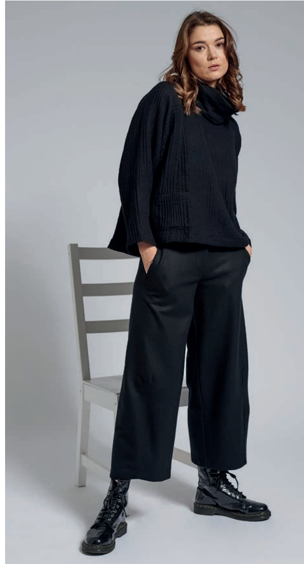
Stufenshirt Softwool 98.21245