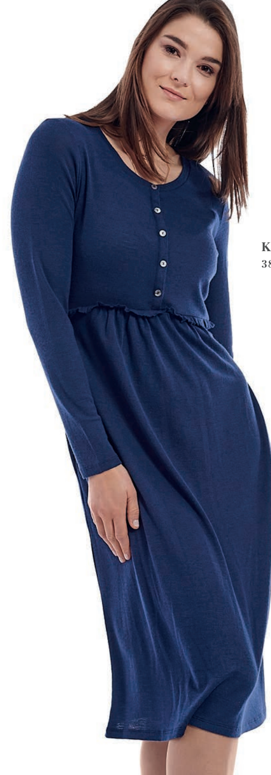
Kleid Merino-Modal 38.21222