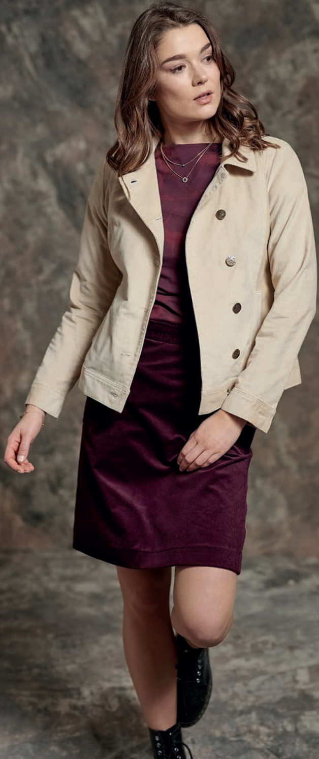
Jacke Babycord 42.21238