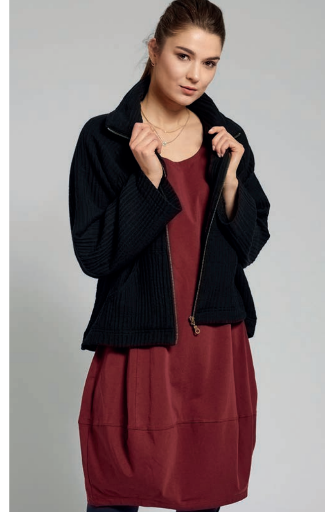
Kleid Baumwolljersey 81.00513