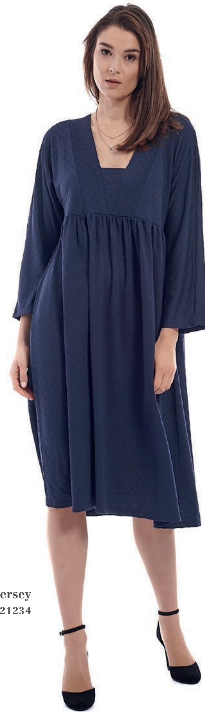
Kleid Viskosejersey 39.21234