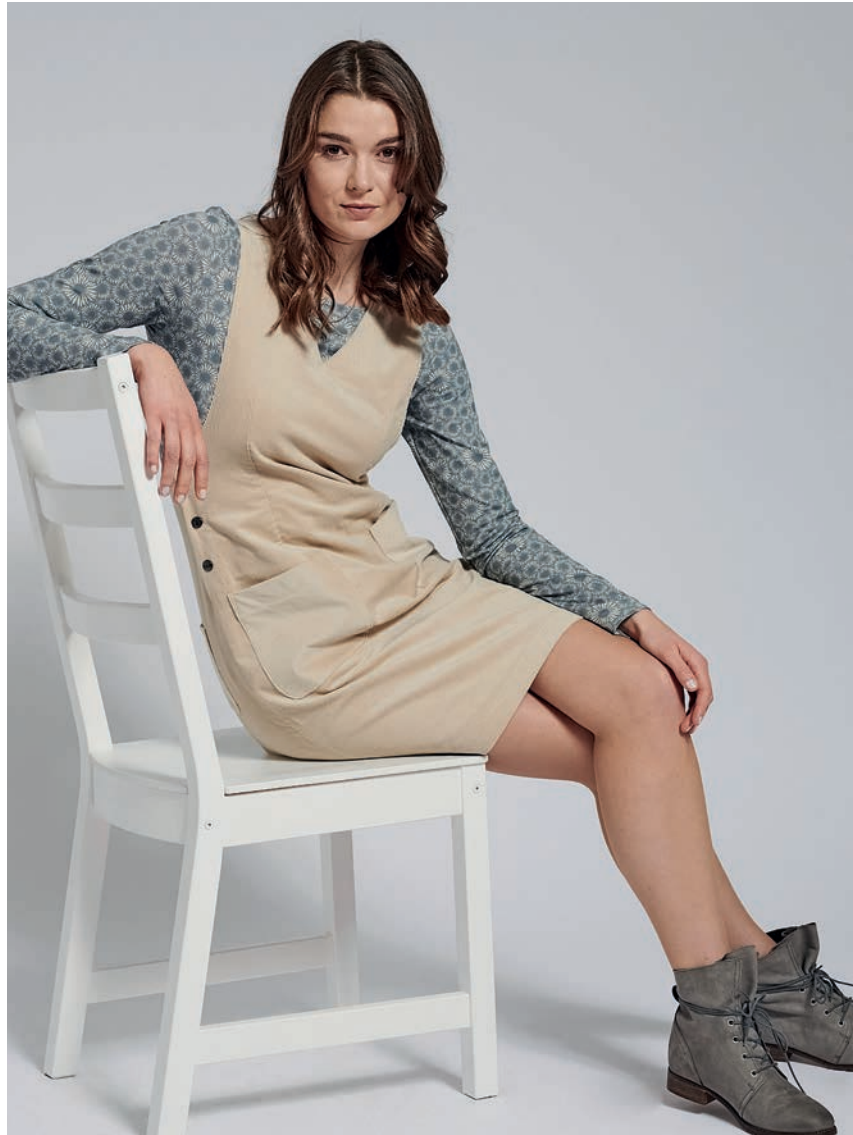
Trägerkleid Babycord 42.21239