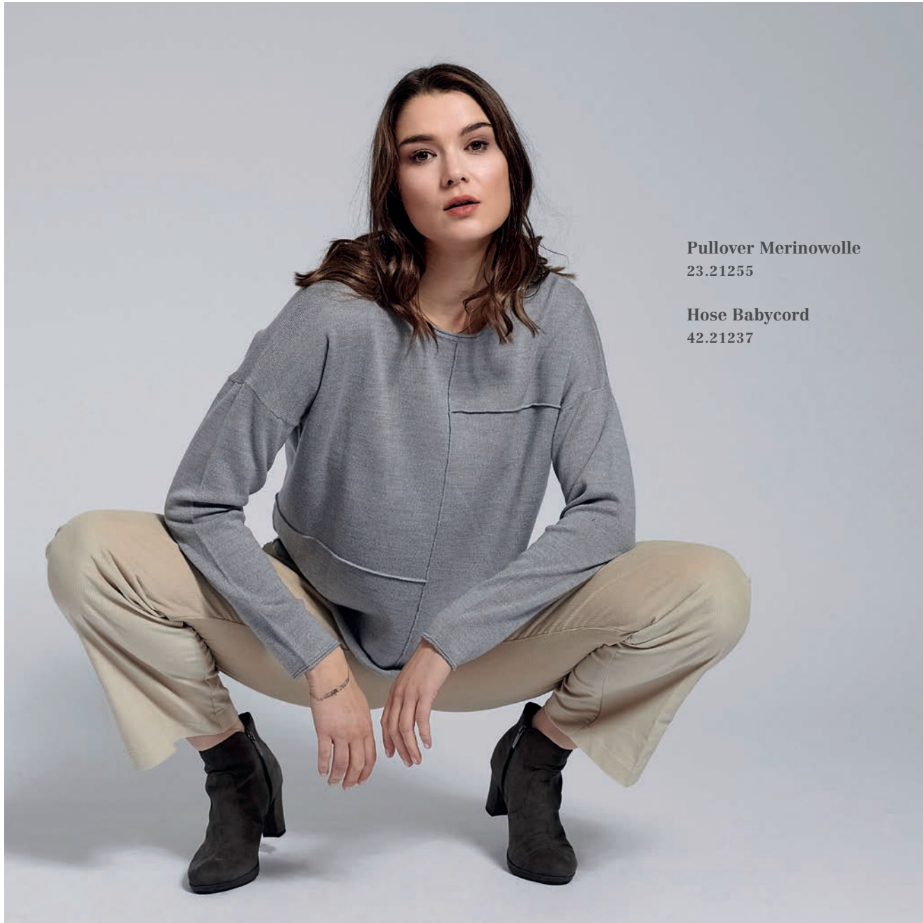
Pullover Merinowolle 23.21255