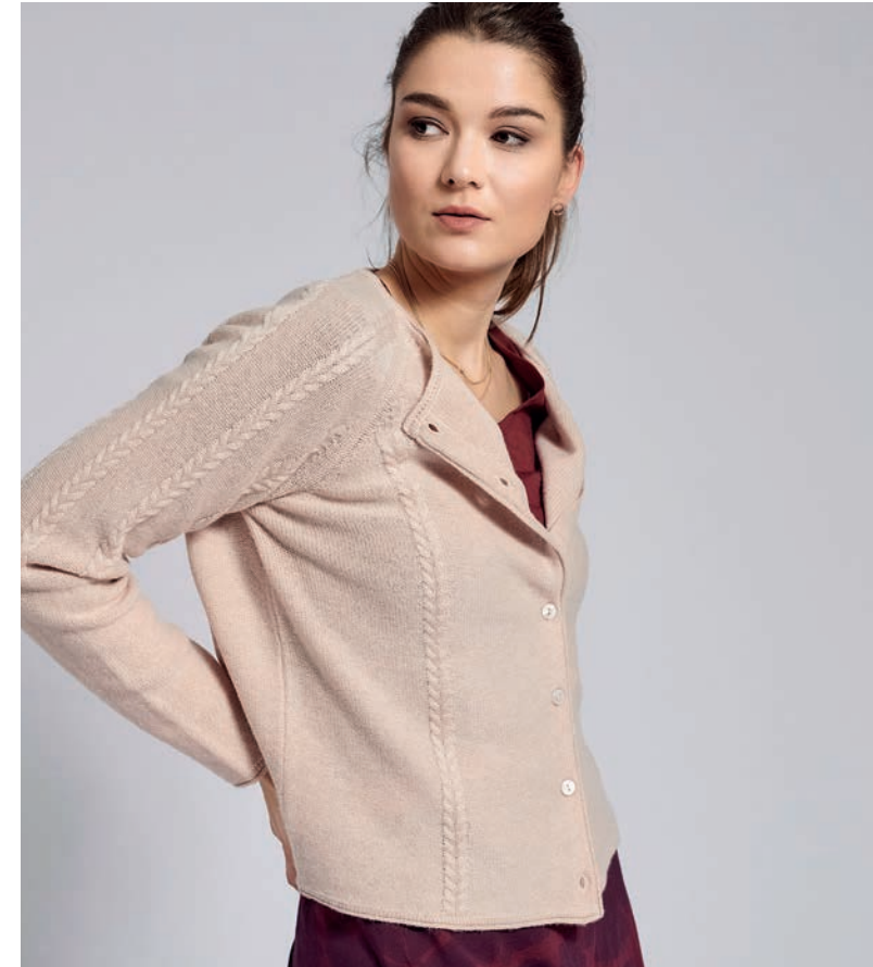
Cardigan Cashmere 12.21251