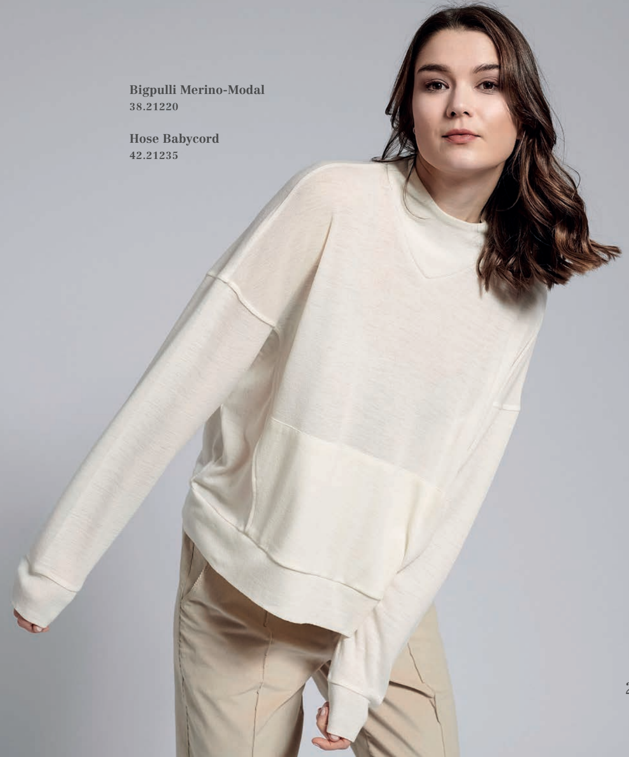
Hose Babycord 42.21235