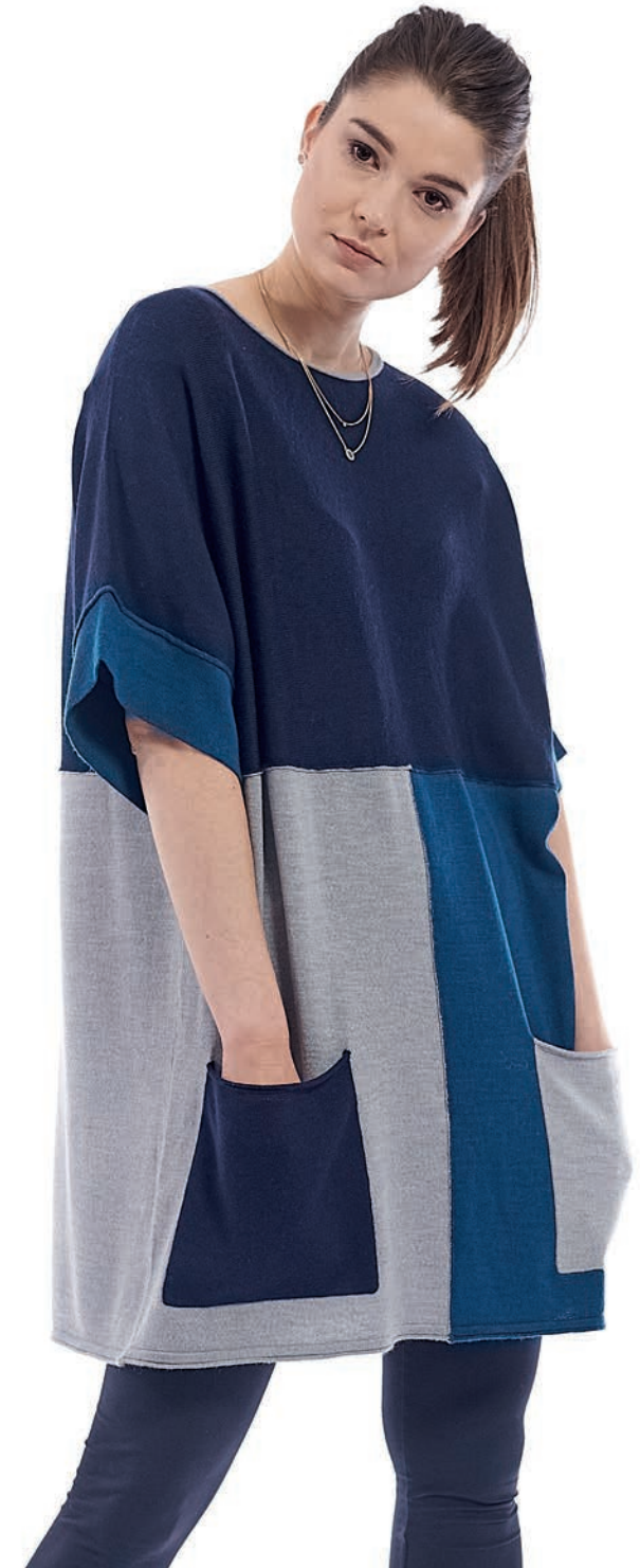
Leggings Baumwolljersey 81.00314