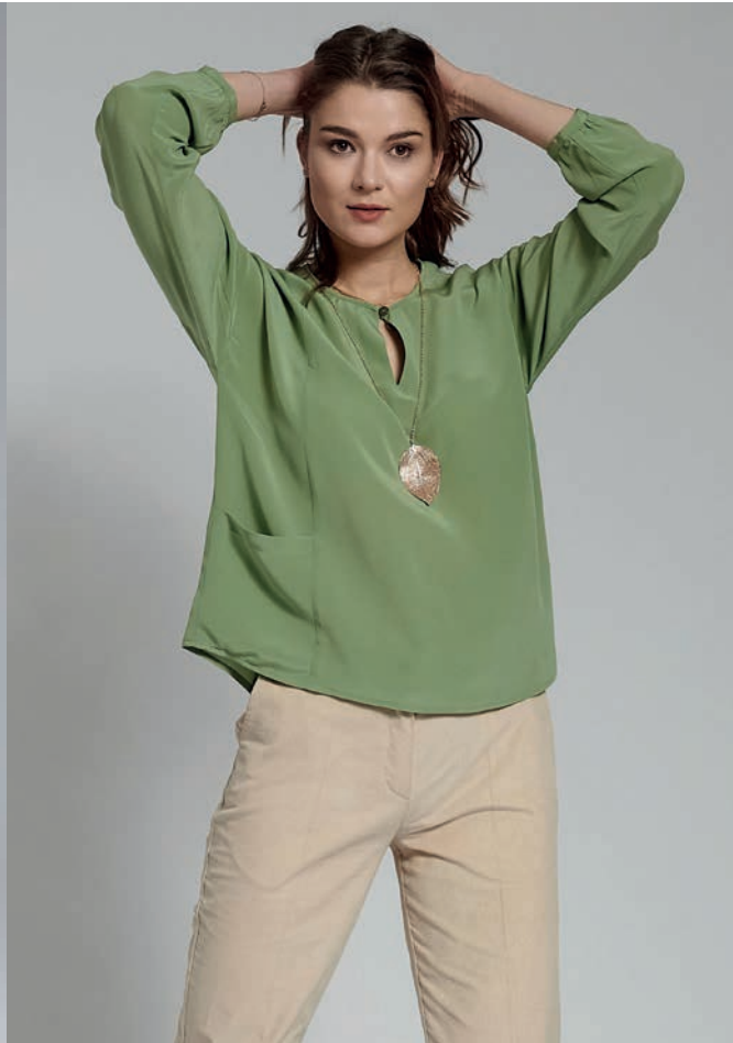
Shirt Seide 32.21227