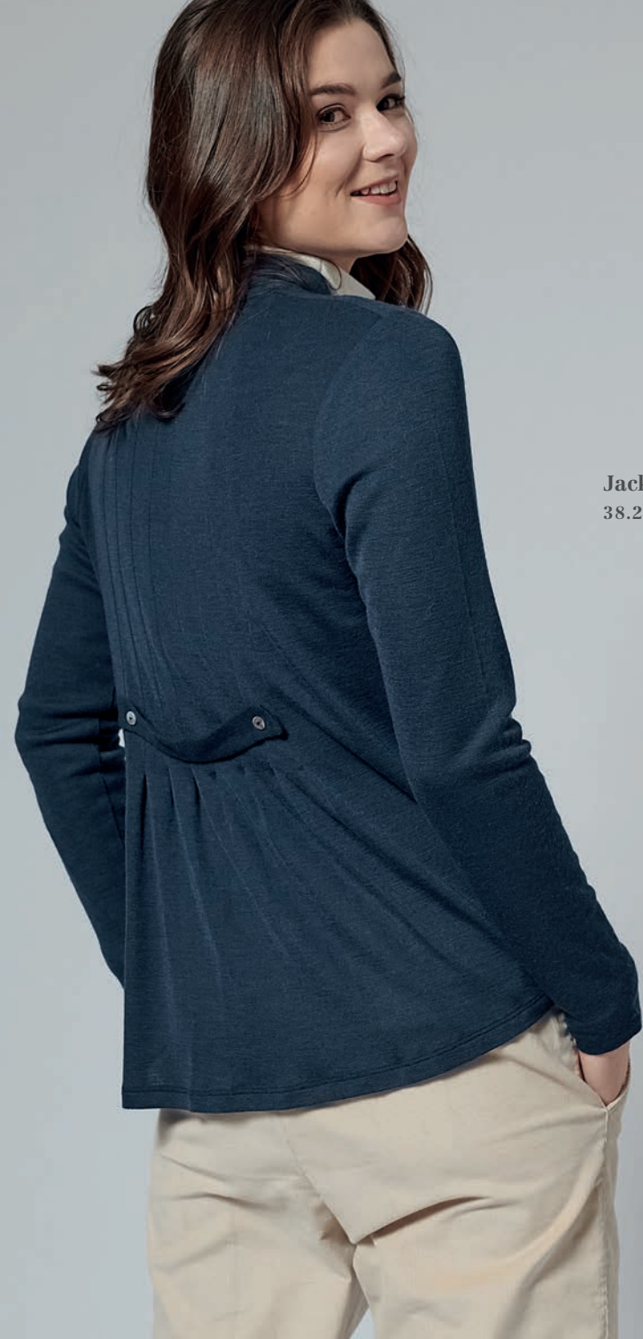
Jacke Merino-Modal 38.21217