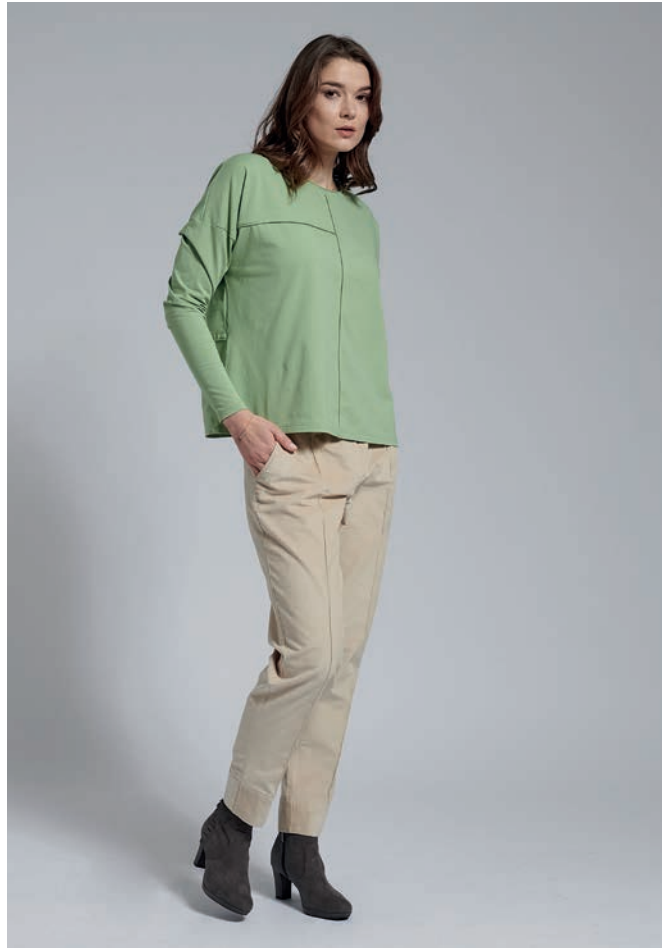
Shirt Baumwolljersey 81.21202