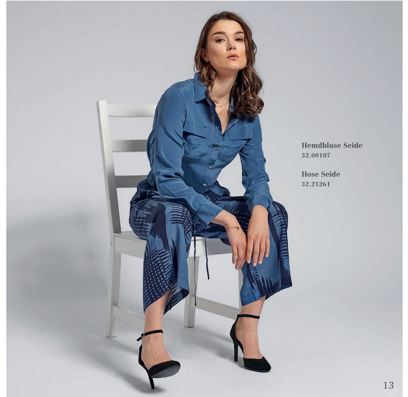
Hemdbluse Seide 32.00107