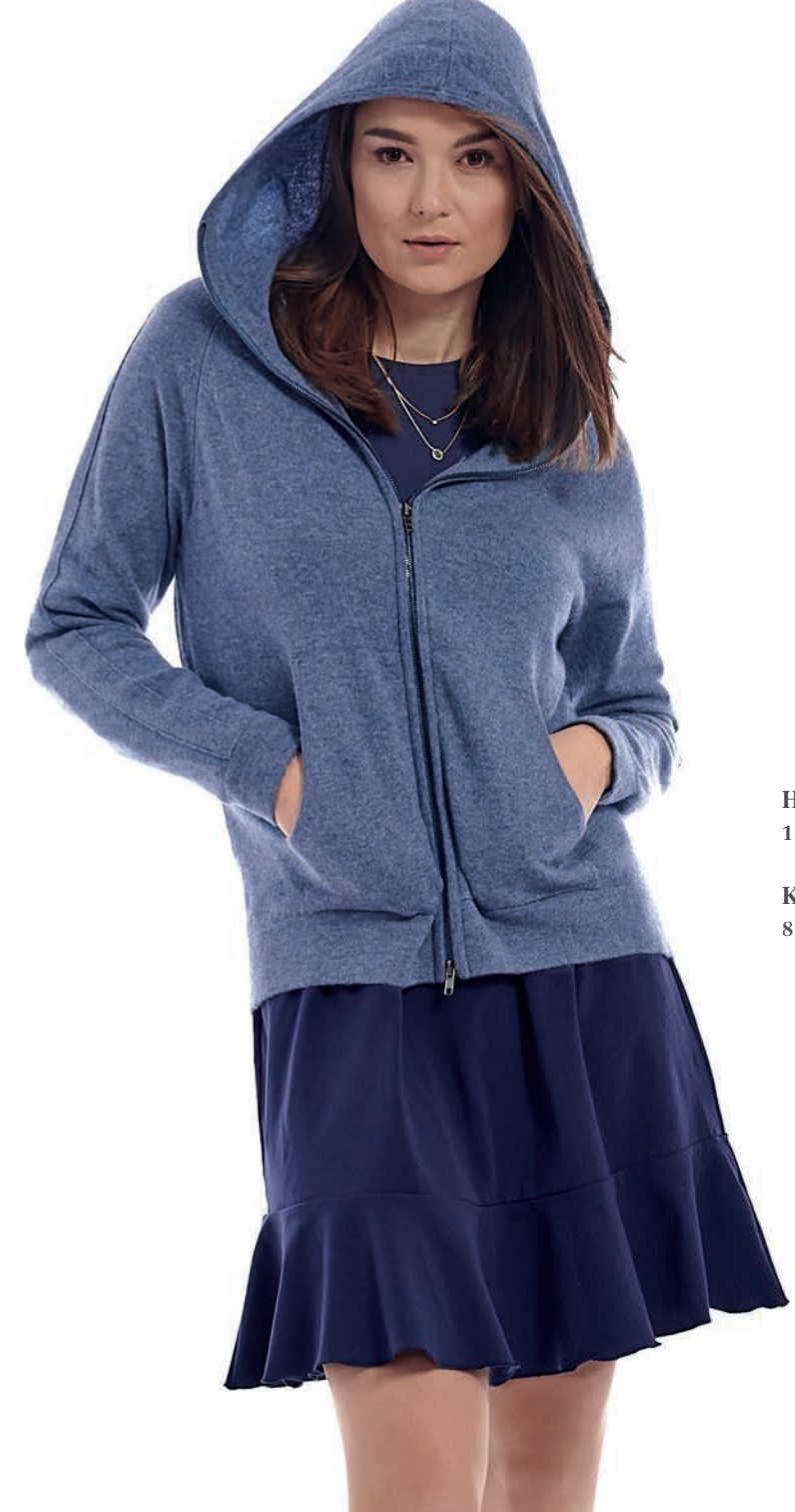
Hoody Cashmere 12.21252