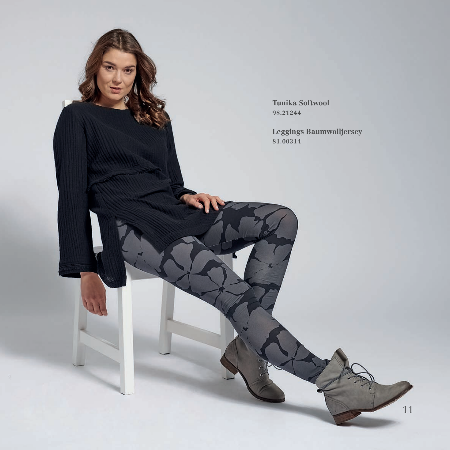
Tunika Softwool 98.21244