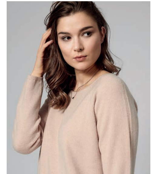
Pullover Cashmere 12.21253