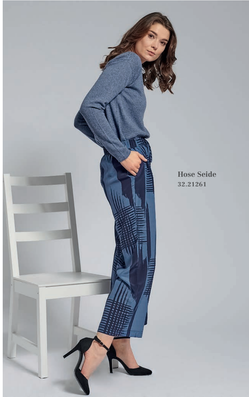
Hose Seide 32.21261