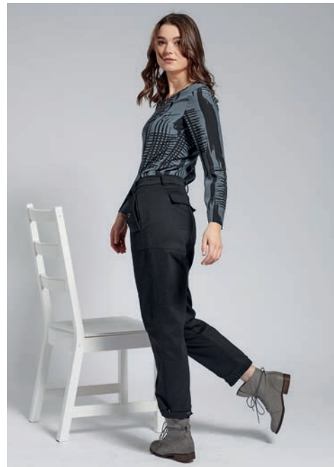
Shirt Seide 32.00101