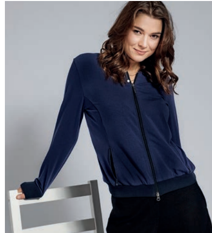
Jacke Baumwolljersey 81.21203