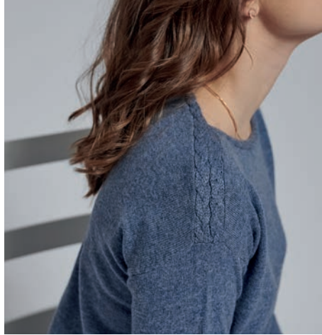
Pullover Cashmere 12.21250