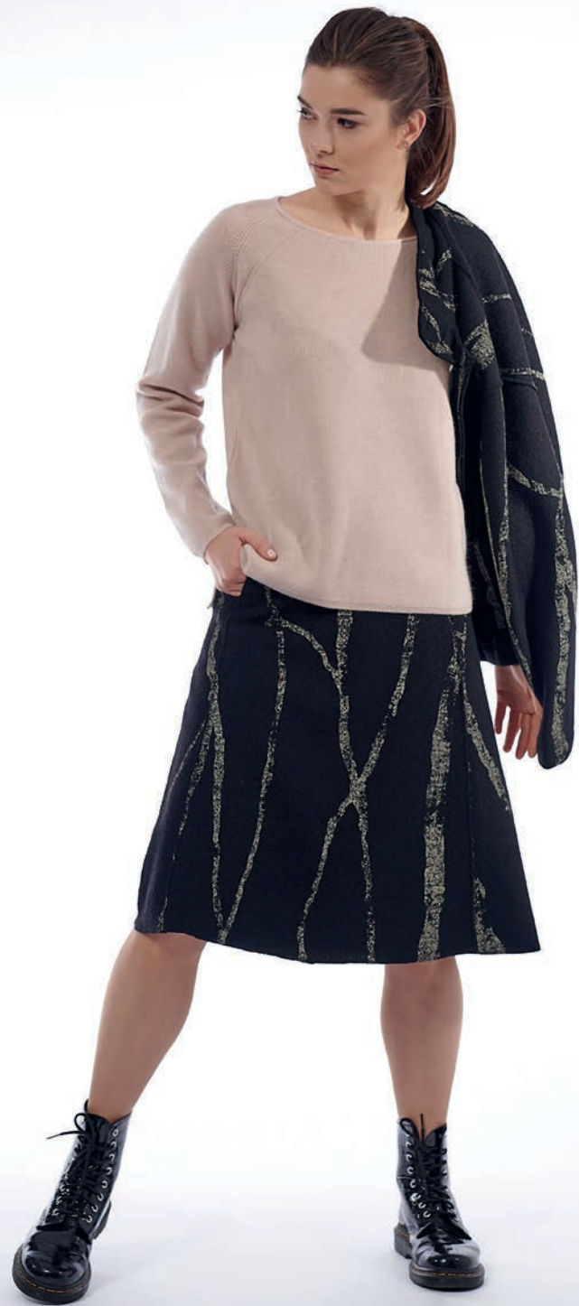
Pullover Cashmere 12.21253